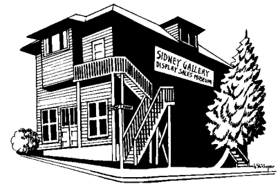
Sidney Art Gallery & Museum