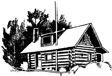
Log Cabin Museum