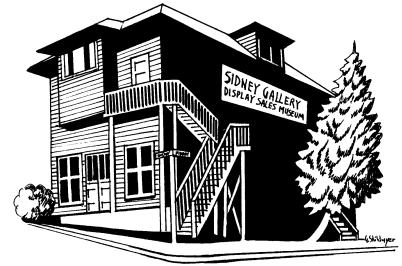
Sidney Art Gallery